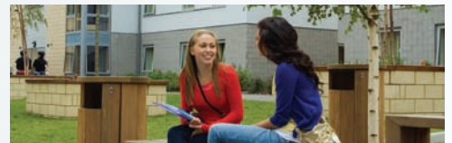
Multi-billion campus revamp at Kent