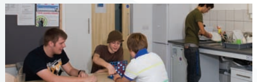
Enhancing the student experience