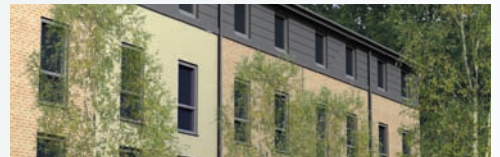
First phase of construction complete at Exeter