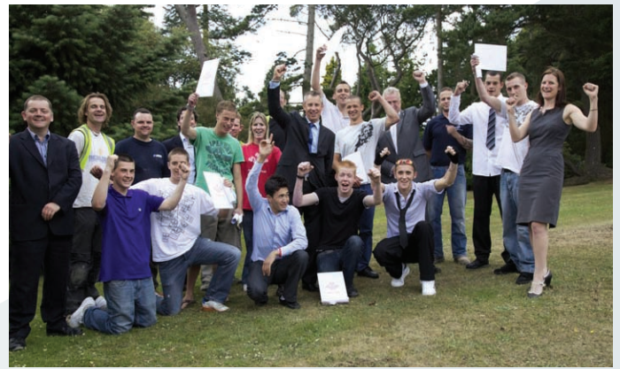
Young people from UPP's 'Get into Construction' course at the University of Exeter celebrate the completion of the course

Skills Certificate Scheme (CSCS) card. This card is a 'passport' to working on a construction site and is essential for a career in the industry.