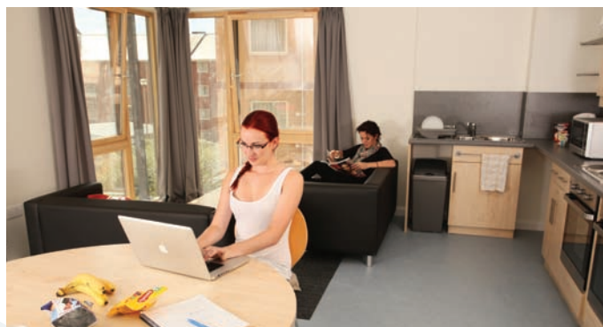
UPP's scheme at the University of Exeter will provide 2,569 rooms upon completion

The construction work at the University of Exeter is progressing well and is running on time and on budget. Students at intake this year have seen the benefit of the first phase of this fantastic project, with new rooms which cater for their needs.