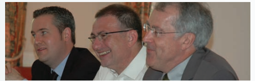
Partners View - HE Week