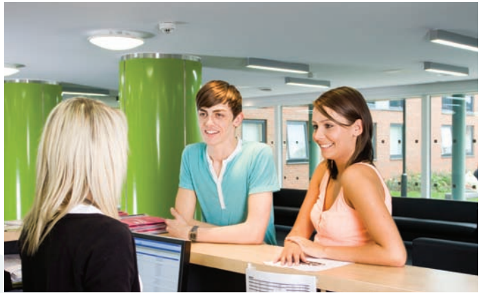
URSL staff assist students at Carnegie Village, Leeds Metropolitan University

Having worked closely with the Higher Education (HE) sector for well over a decade, our team has a strong appreciation of the importance of delivering a high quality student experience as part of university life. When we established URSL, our residential management services business, this was one of our key motivations - to partner with universities in improving the quality of HE residential management services and in turn change the expectations of students. We are expanding our residential management services offering to more universities and we are committed to continuing to play our part in enhancing the student experience.