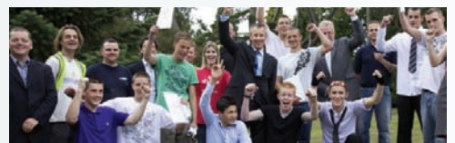
'Get into Construction' with The Prince's Trust