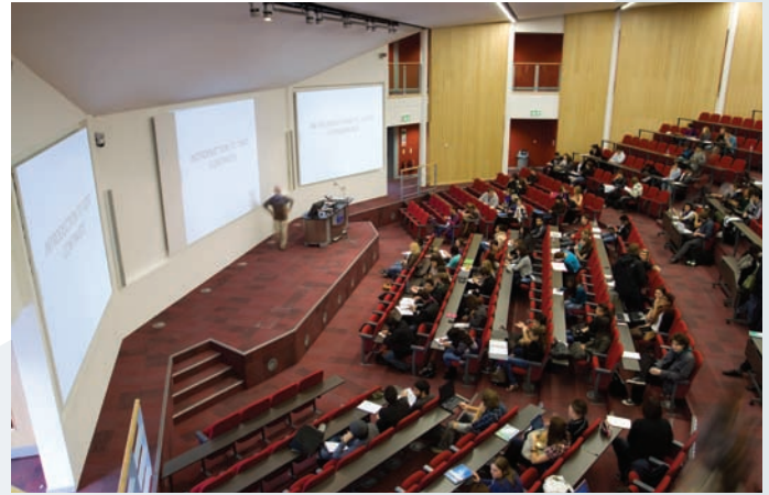
University of Kent's 470-seat lecture theatre, part of academic facilities at Woolf College

We believe that demand for this model is likely to increase given that HEFCE has made it clear that future capital funding for universities will be linked to carbon performance. HEFCE, Universities UK and GuildHE have set out sector-level targets to reduce carbon emissions by 80% by 2050, and by at least 34% by 2020 (against a 1990 baseline) – the UPP Eco Residence model will help universities to meet these goals.