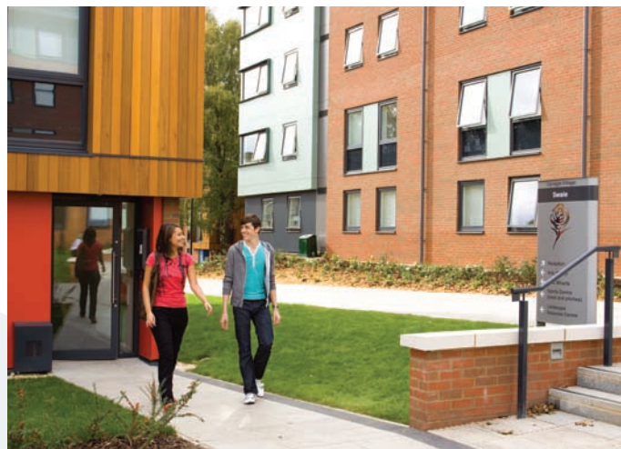
Carnegie Village, Leeds Metropolitan University

The 1994 Group has also chosen to work in partnership with UPP to develop a roundtable debate entitled 'How are universities driving environmental progress?' as part of Universities Week. Universities play an important