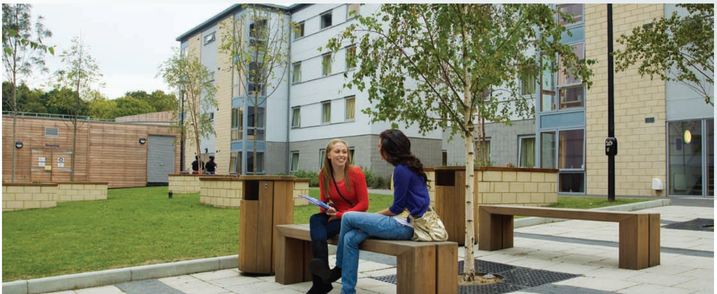
£30 million of private finance invested by UPP into facilities at the University of Kent