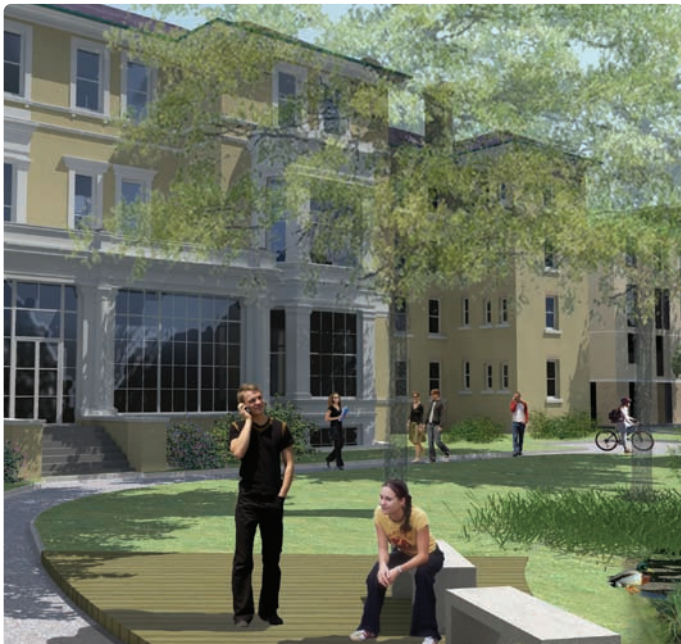
Estimated £50 million Eco Residence scheme providing 800 rooms at King's College, London