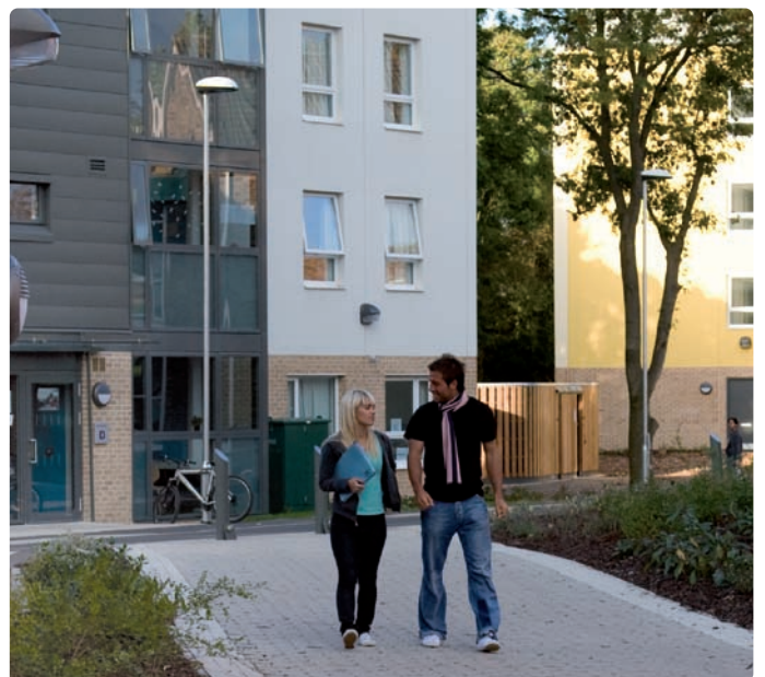
£60 million private finance invested into a 1,300 room scheme at Loughborough University