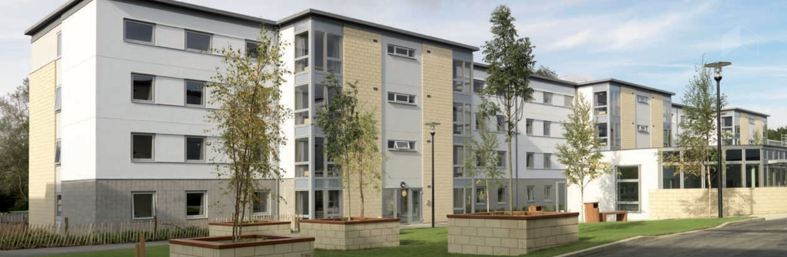
£30 million private finance invested into residential and academic facilities at the University of Kent