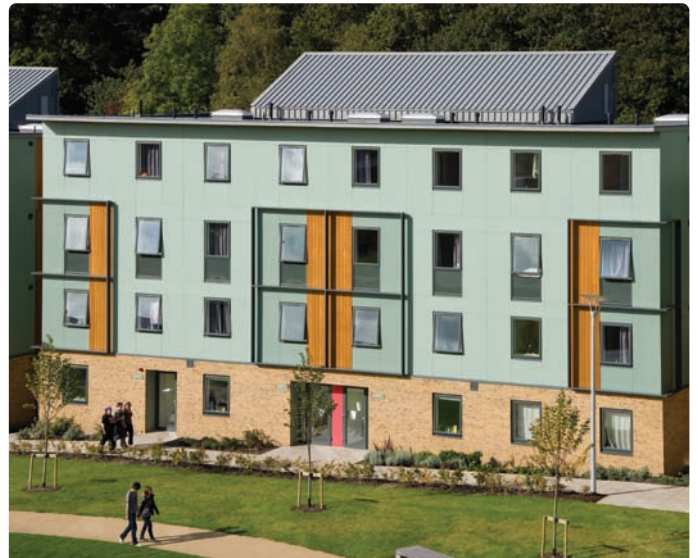
Lancaster University's £100 million-plus programme is the single largest university new accommodation project in the country

The university estate has a growing presence as an asset class, and the university accommodation sector has been performing well despite a tough economic climate. UPP is the natural partner for universities to leverage this opportunity and access private capital.